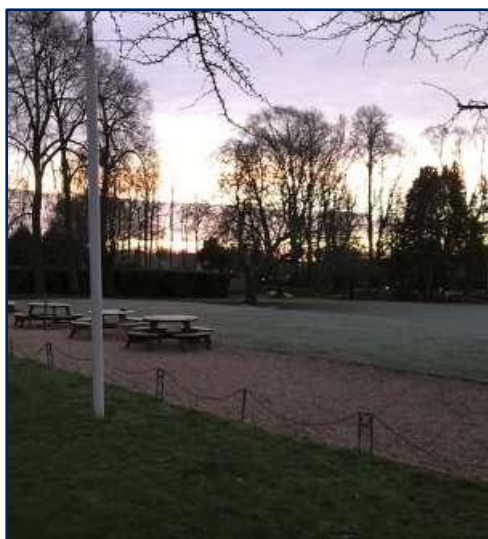
Early morning sunrise!