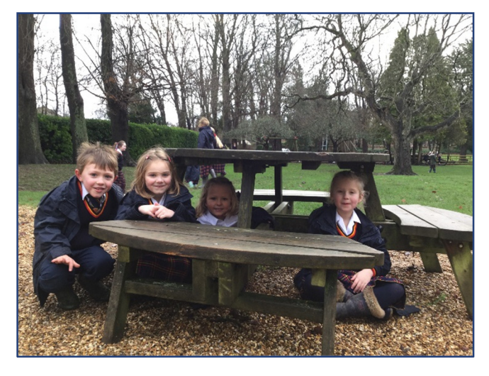
Taking cover from Storm Brendan