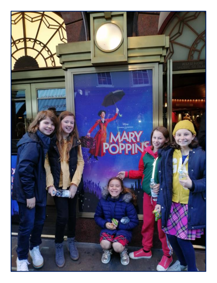
Forms 5 – 8 London Trip