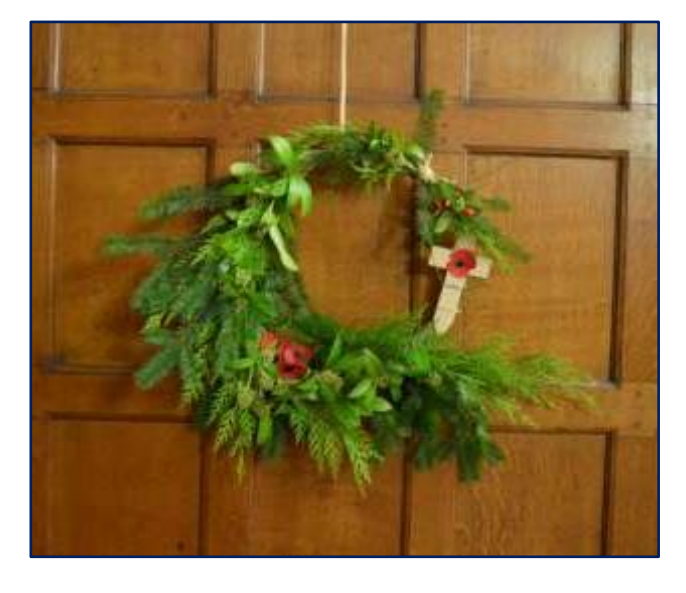
Wreath created by Dorset Flower Farmer