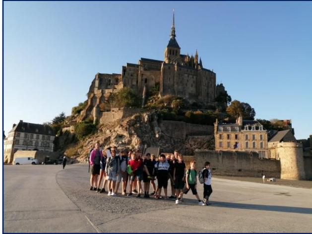
Form 7 – Mont St Michel