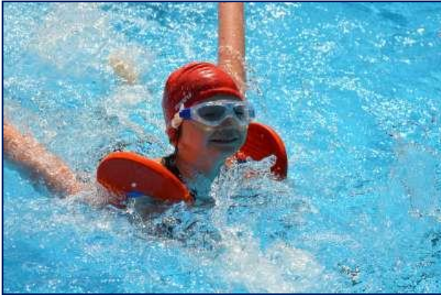
Junior Swimming Gala