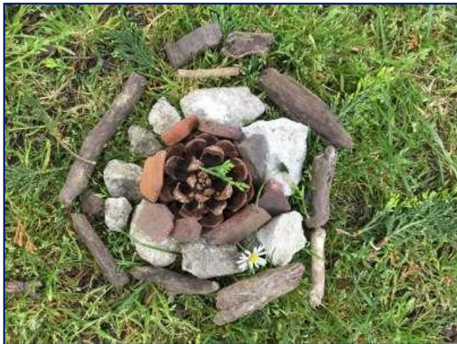
Form 2 'Andy Goldsworthy' style art