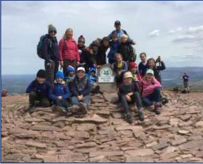
Pen y Fan in Wales