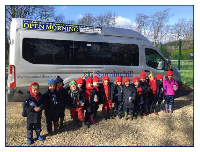
Reception children heading off to Kingston Maurward.