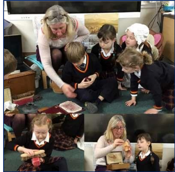
Florence Nightingale Role Play Corner

Nursery celebrated World Book Day this week, they all had the opportunity to dress up as a book character. We had super heroes, princesses and fairy-tale characters.