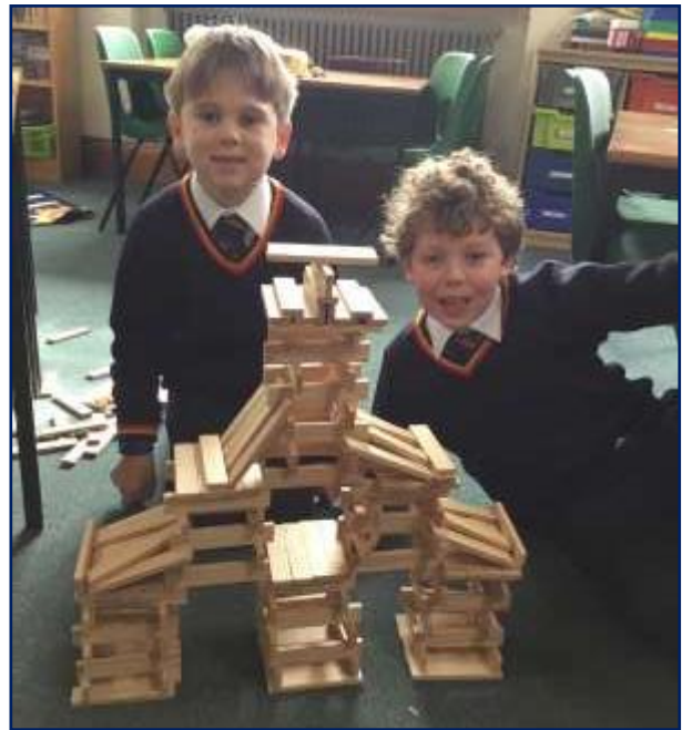
The latest construction club masterpieces