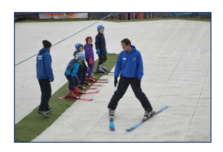
Form 2 Skiing at Warmwell

We have also enjoyed designing and colouring in our very own gingerbread menthey are so bright and colourful!