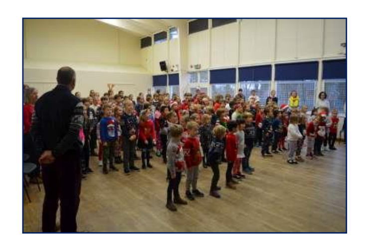
Christmas Jumper Day