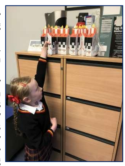
around the house. £84.00 from 22 candles!

Christingles candles have been streaming week. this in They have all been filled with copper coins. Whilst thev might be small in value it astonishing how much money is raised bν collecting loose change lying