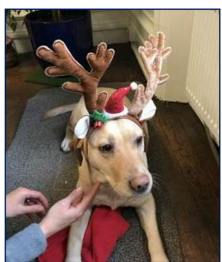
Molly feeling festive!

Finally, today has been a most wonderful way to end a superb term.