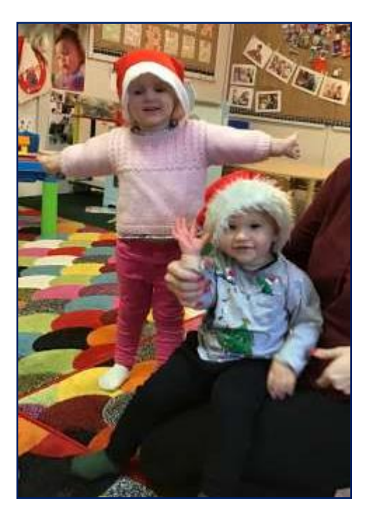
Merry Christmas and a Happy New Year to all!

Last but not least all of us at Fledglings would like to say a special goodbye to the few children who are moving onwards and upwards. It has been a pleasure to watch you all grow and develop and we wish you all the very best.