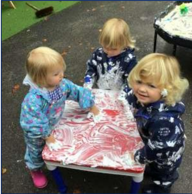
Fledglings having fun!