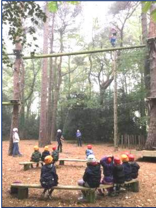
Form 4 - High Ropes