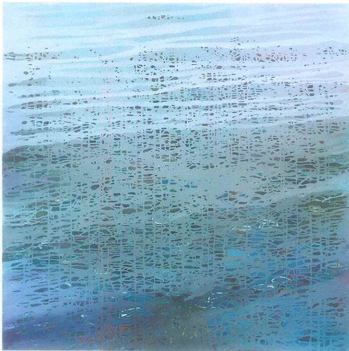
Current by Luke Elwes oil on linen, 102 x 102 cm