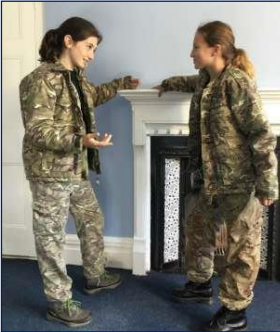
Much Ado About Nothing!