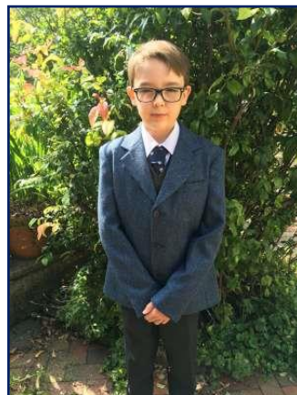
A former pupil on his first day at Senior School!

It is always satisfying to hear how our ex pupils have been getting on at their senior schools and now that the summers results have come through we can also celebrate and share in their success.