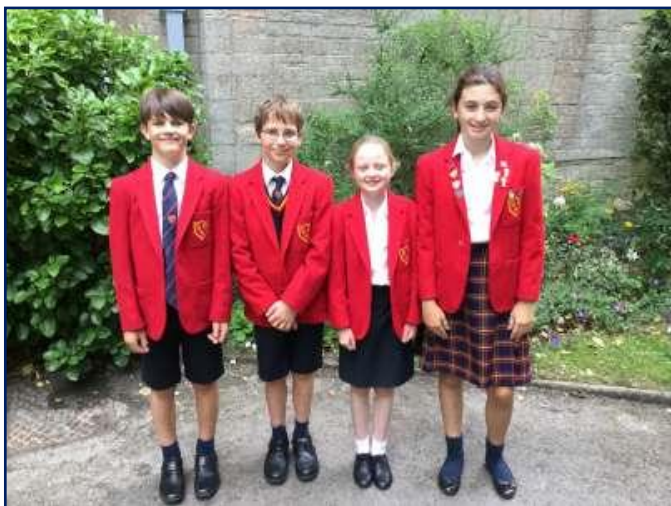
Head Boy, Head Girl and Sports Captains