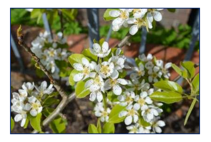
Next week; wild flowers and courgettes!

The fruit trees are all blooming with gusto which bodes well for our summer crops, the children are already excited about the cherries! They seem similarly excited about the garlic, I wonder how many of them will be as keen this year to try it raw again!