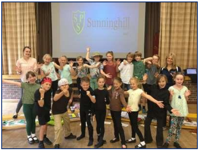
Form 4s rainforest themed assembly