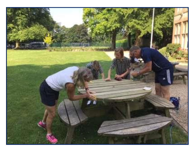
One of the up-cycling teams hard at work!

All this amidst sweltering temperatures that were last exceeded in the drought year of 1976. School has been breathless.