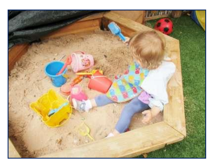
It is always more fun to knock down a sandcastle than make it!