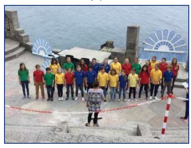
Fabulous views for our Cornwall Choir Tour

what I hear they have been having an amazing time. It's fantastic that some parents also made the journey to The Minack Theatre to enjoy the event.