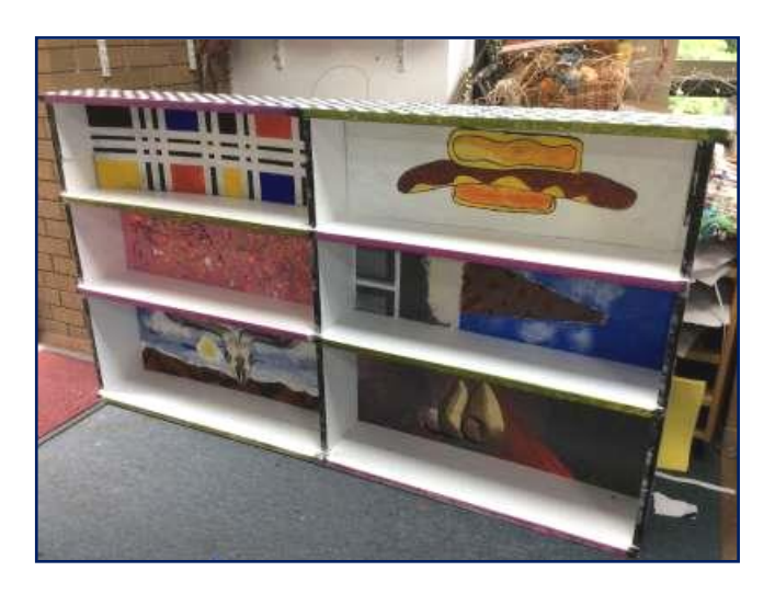
An eclectic mix of designs

We researched modern artists and worked along that theme to plan and paint our pieces. The old bookshelf was crying out for a makeover and the result has exceeded expectations.