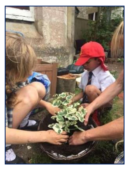
Planting up the hanging baskets