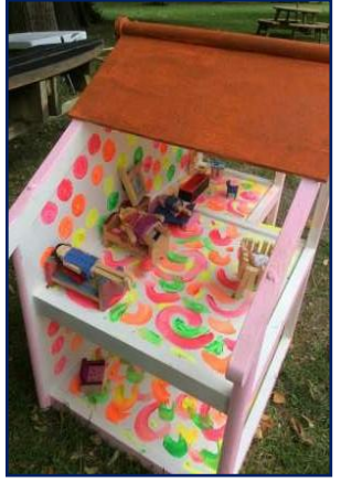
A modernist approach

We researched modern artists and worked along that theme to plan and paint our pieces. The old bookshelf was crying out for a makeover and the result has exceeded expectations.