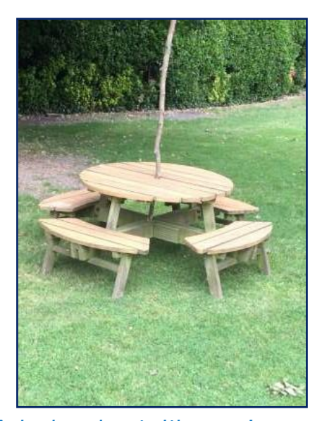
One of the benches is like new!

This week Forms 5 and 6 have learnt how to prepare a piece of furniture for up cycling.