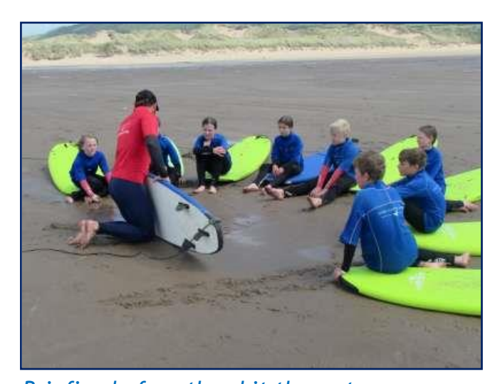
Briefing before they hit the water

On day three we went for a 12 mile walk! We drove to Withypool and walked to the iconic tourist attraction Tarr Steps a Viking (hand-made) bridge. It took us about 6 hours in total. When we arrived at Tarr Steps we had a well-earned break for lunch then had a walk over the bridge and back to Withypool. On this night we slept at the Rock and Rapid bunkhouse.