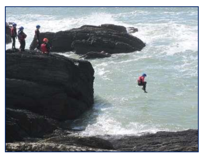
Got to be brave to jump

On Thursday we went coasteering and surfing. In the morning we went to Saunton Sands to go coasteering. When we arrived we walked down to the rocks and got in. Then we swam round the rocks, jumped off etc...until it was time to stop. I jumped off a really high rock and I was really scared but, I managed to do it in the end. Then we got changed and had lunch on the beach, got changed again and went surfing. It was absolutely exhilarating!!! I had never surfed before but, when you got riding the waves it was such fun. I enjoyed it massively.