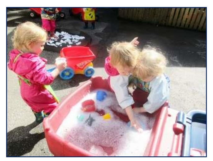
Sharing the bubbles

Hurray for the sunshine after the deluge on Wednesday! Fledglings experimenting with water and foam play