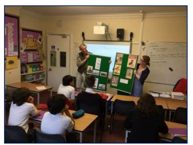
Planning the afternoon's activities

Congratulations go to our history scholars who led their session in a professional and informative manner.