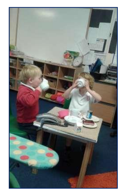
Some of us can drink two at once!

The children have also enjoyed playing in the home corner and acting out roles within their play.