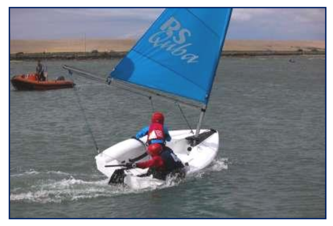
Struggling to keep upright in tough weather

The results were more of a reflection of survival ability rather than any knowledge of racing a boat. At times there were 4 boats out of the 6 bottoms up with rescue teams working hard. That said patterns did emerge during the day and those that made the least mistakes moved up the leader board. Mistakes in the conditions were very costly as they usually meant a capsize.