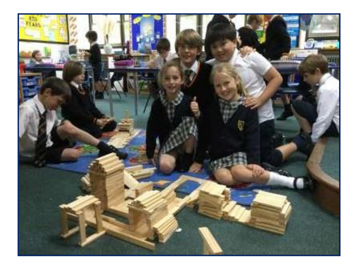
Rightly proud of their teamwork

Invented by Dutchman Tom van der Bruggen in 1987, KAPLA is an educational wooden construction toy - Forms 3&4 have just bought a 1000 brick set for the children to use!