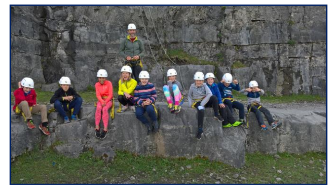
Pre climb and abseil

day than a BBQ and marshmallows round the campfire. The owls in the wood later were a perfect touch but most were asleep by then!