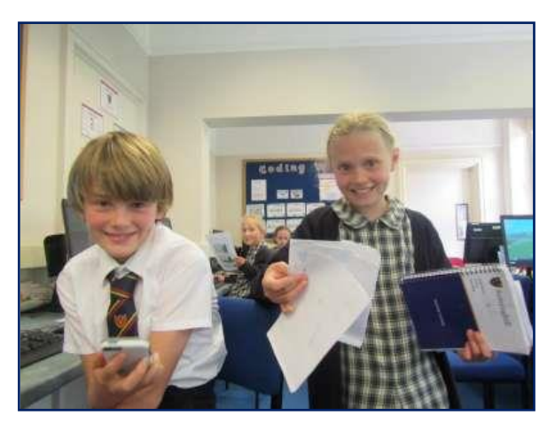
Modelling the homework app idea