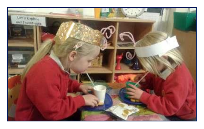
Snacking like a butterfly

Last Friday the children finished off the day by acting out being a butterfly by collecting their nectar and sucking their pollen. They were using Wotsits and blackcurrant squash. They all had a great time and thought it was very funny.