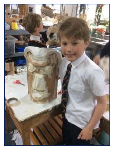
Looking great but a little more to do

These are work in progress that will be finished after half term.