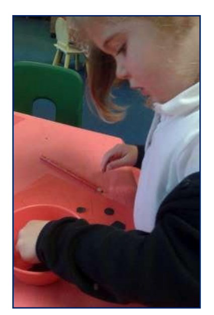
Carefully counting out the spots

The children all drew a ladybird and had to count out a predetermined number of spots from a larger pile. They all had to think hard and use their counting skills to put specific, but different numbers of spots on each side then relaying these numbers to an adult and adding them up. They also had to think to name their own ladybird beginning with the letter 'L'.