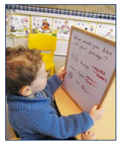
Mmmm now what shall I have?