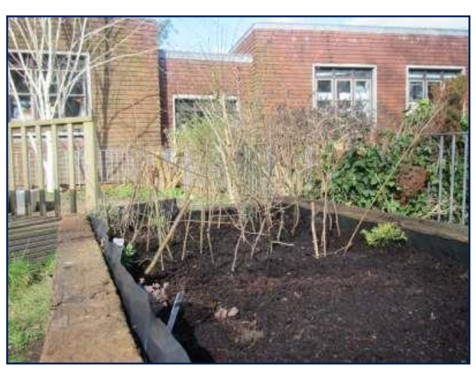
Some of our fabulous donations

they donated all our herb plants and some great seeds, and they have promised more things as we go along, for which we are extremely grateful. For those of you who are not familiar with the centre it's next door to the new Queen Mother statue, opposite the mini Waitrose store, and is a treasure trove of all things green and growing.