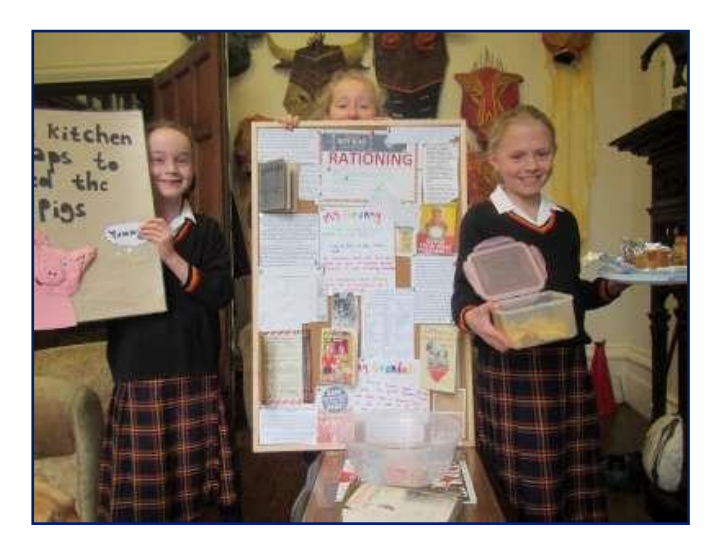
Demonstrating lots more beautiful work

We would also like to share some lovely poems written by a couple of F4 pupils.