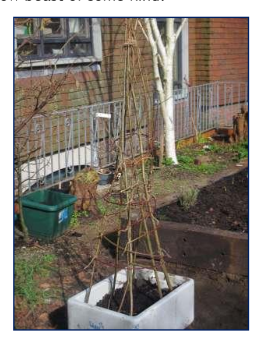
Our willow tree sweet pea structure

A wonderful structure was created from willow to support the sweet peas when they appear. Next week I am hoping the sculpture team may up the anti and produce a willow beast of some kind.