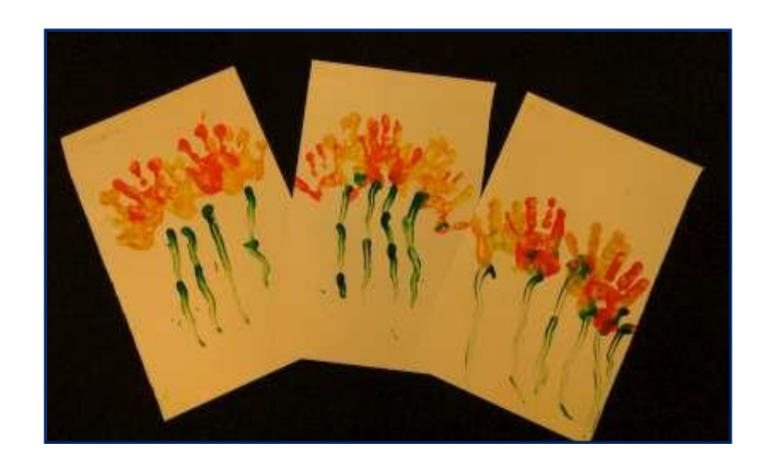
Daffodil hand paintings

Spring has begun! Children enjoyed painting daffodils and flowers using their own handprints.