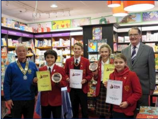
Our award winners