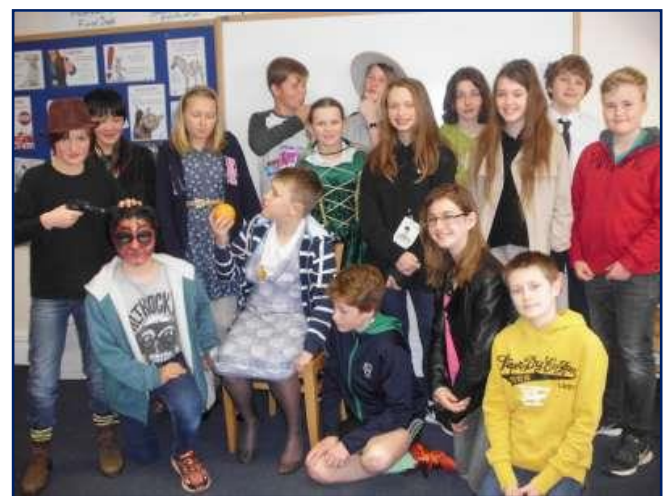
Form 7 during World Book Day

On Thursday nearly all the schools of the UK enjoyed World Book Day. It was fascinating to see the array of costumes on show. Predictably, there were many Harry Potters and Hermione Grangers, not to mention more than a few Dennis the Menaces. Less predictably, a very independent minded and good humoured boy in Form 7 came as the lead character from "The boy in a Girl's Dress". Wearing stilettoes, a very nice dress and ample bosom, he cut a dashing figure across the school!