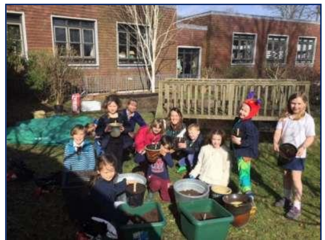
The green fingered spring gardening club