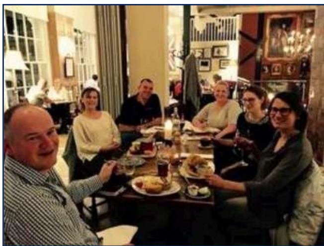
PTFA meeting in full flow!

Back to my fictional date with the Duchess of Cornwall, on Thursday the PTFA met at the gastro pub with the same name, to plan events for the summer term. The main event will be the Summer Fayre on Saturday 1 st July.