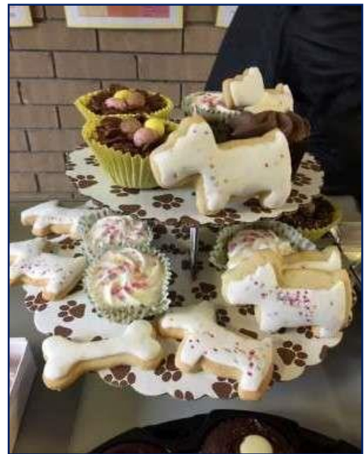
The fantastic guide dog themed biscuits