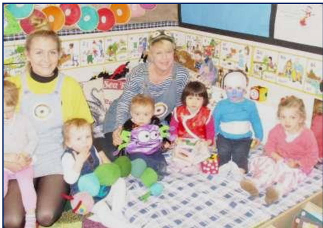
A group shot of all of our characters

Fledglings enjoyed dressing up for World Book Day