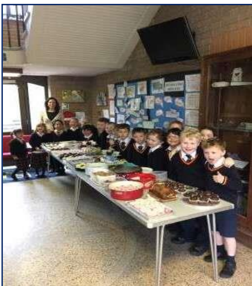
Form 1's very successful cake sale

Today I was delighted to see that the first class fundraising event for our Guide Dog appeal took place with a Fun Food Friday cake sale, generously organised by lovely parents from Form 1. There was a decidedly doggy theme to the cake including Labrador cupcakes and sausage dog shortcake. A total of £164.80 was raised which will be added to the donations made yesterday to begin to work towards our initial target of £2500. I'll say more about this next week as we now have a Just Giving page all set up and ready to go.