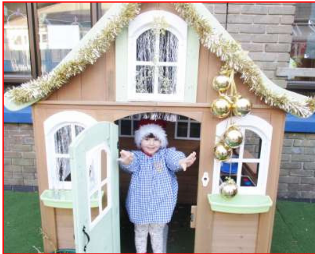
Happy Christmas from Fledglings!