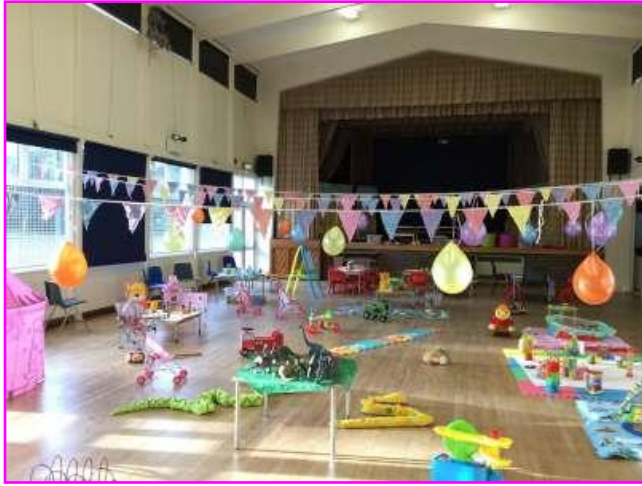
Preparations for the Toddler Christmas Party