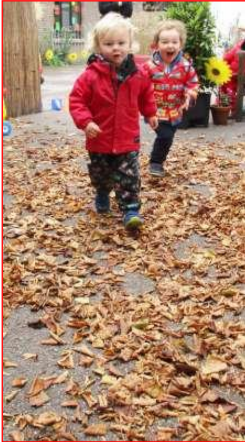
Fledglings in action! Running, scrunching and kicking the Autumn leaves