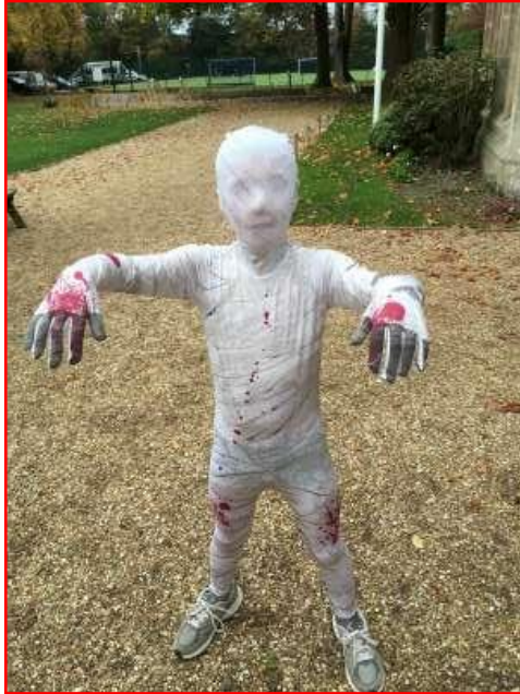
Year 4 Egyptian Day!