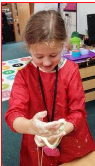
This week in Form 2 we have had fun painting jars for 'The Grubber' sweetshop and making gloop.