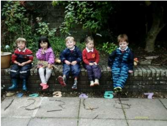
Daisy and Daisy enjoying the coloured sand