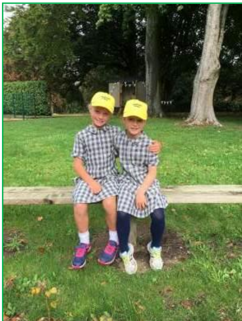
Two playground helpers

https://www.justgiving.com/fundraising/mjwillemse