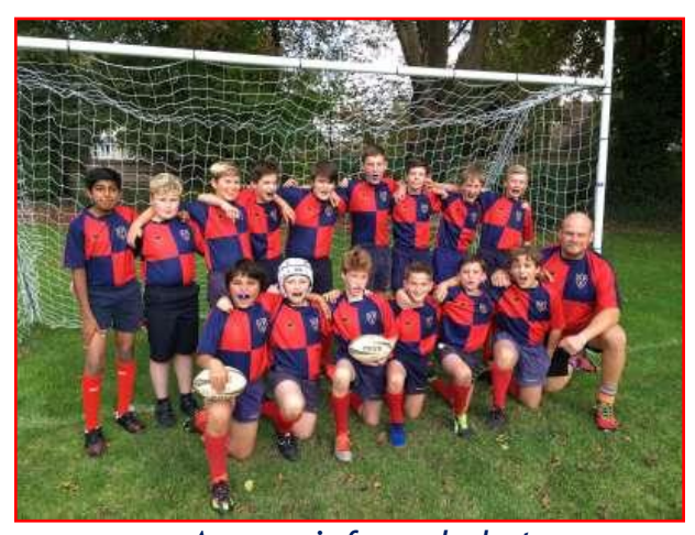
A more informal photo

You will see below a great photo of all the senior boys wearing their new rugby strip. They look incredibly smart and proud, though I'm not sure that big boy in the front row with not much hair will get a game. The shirts were a very kind leaving present by the lovely Douie-Legg family. We were delighted to present Brook with a shirt too.