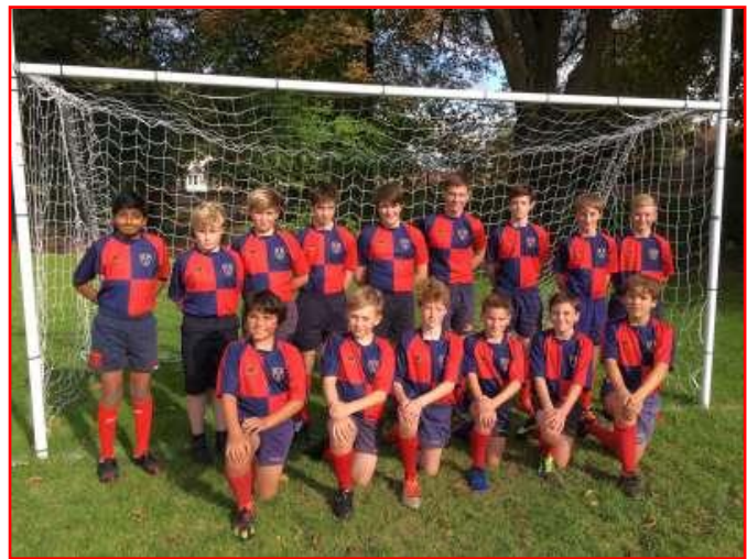
Our new rugby kit

7<sup>th</sup> October 2016 Autumn Term Issue No. 401/65