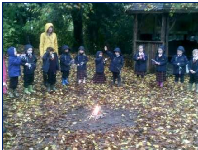
Reception & Nursery having a fire during Friday Enrichment