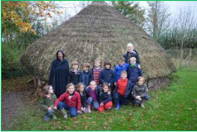
Form 3 become Romans for the day