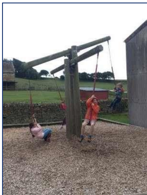
Despite the rain and coats, there's still lots of fun to be had!