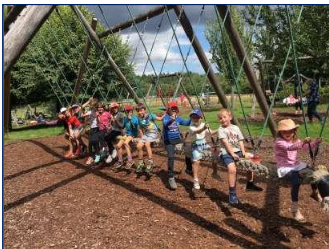
Holiday club trip in the sunshine