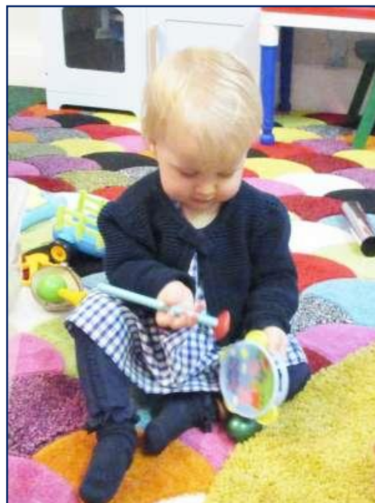
One of our new younger Fledglings exploring the musical instruments