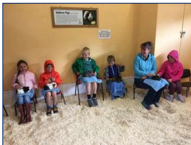
Down at the farm