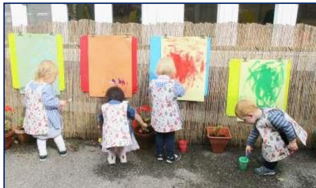
Fledglings using their whole body to paint and create

Welcome back from the Fledglings team. We have 19 children on the register with 4 new starters, we are very much looking forward to settling them all back in.