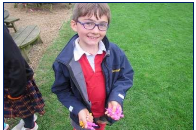
Some found more tees than others!

Elsewhere in school we had a lovely Easter Egg hunt organised by the PTFA. Finding three different coloured golf tees was rewarded with a Cadbury's Cream Egg. The lucky finders of special tees with rings around them received an even bigger surprise. Many thanks to the PTFA for this special treat.