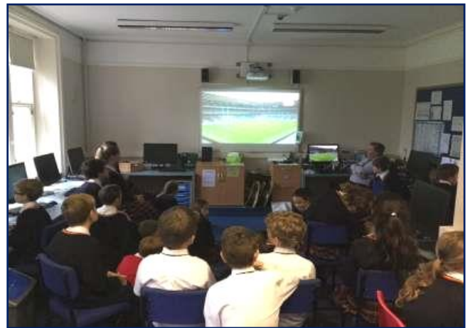
Sunninghill watching the live streaming