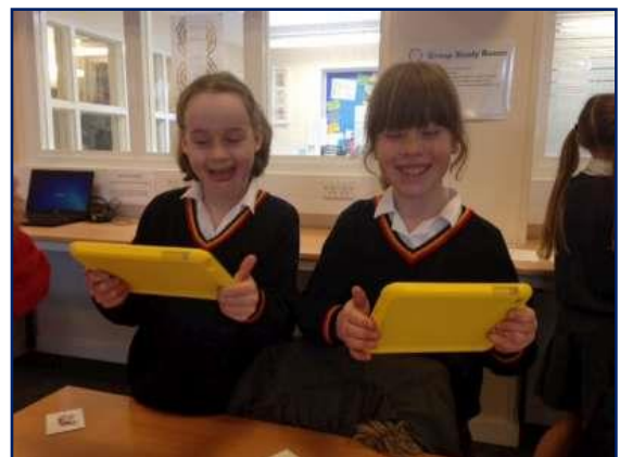
Checking out the gadgets!

It was held at Thomas Hardye School and children from several local schools attended.