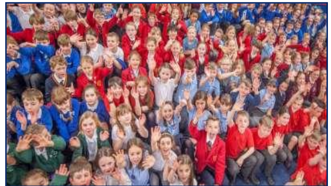
All the come and sing children

On Friday Form 4 took part in a Come and Sing day at Wellington School. They had an afternoon of rehearsals preparing the 12 songs they had been learning followed by a concert in the evening. The day involved 23 different schools and 450 children. It was an incredible experience for them to sing as part of such a big choir alongside a live band.