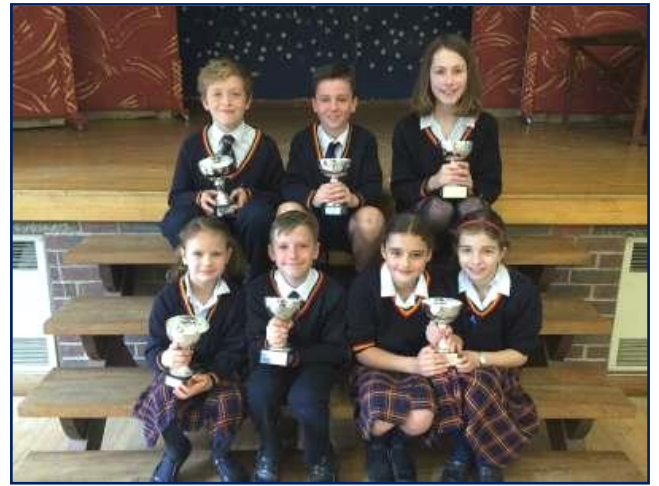
Our sports cup winners

We also handed out Endeavour Cups to recognise individuals in each Form who had made the most progress and effort. We derive the data for these awards from the effort grades which were uploaded onto the Parent Portal earlier in week.