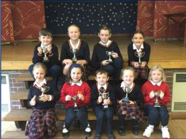
Our endeavour cup winners