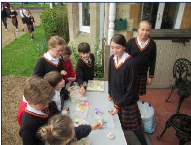
The squishy team!