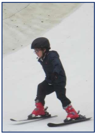
Mastering the technique