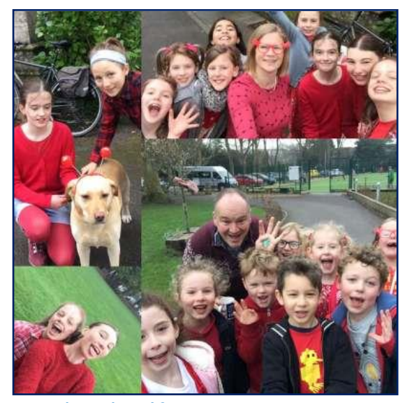
Morning break selfies

Sunninghill have rallied together, as always, and worn red for Red Nose Day. We've managed to raise over £125.00 today for a very worthy cause and have fun in the process. Thank for all your support.