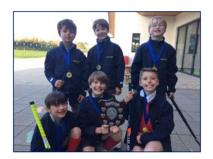
The rather proud team shot!

Congratulations to all the players for their brilliant team work!