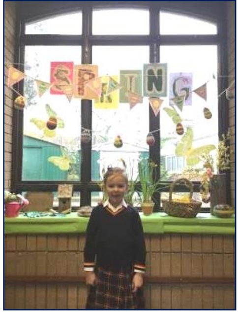
Another proud member of Junior Prep