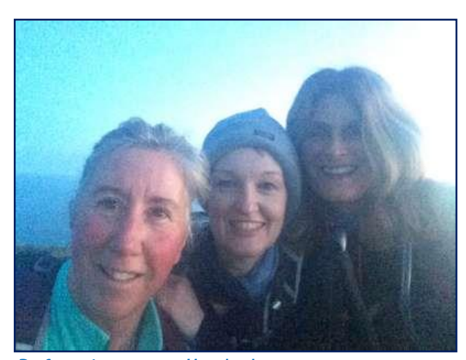
Before it got really dark