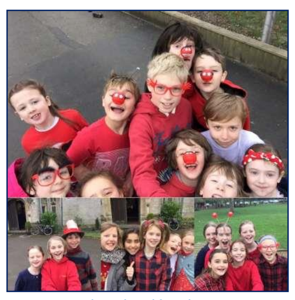
More morning break selfie shenanigans