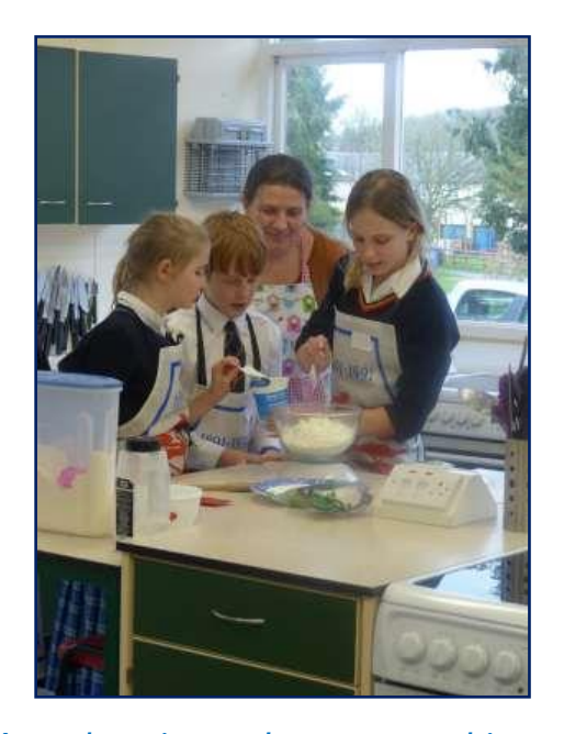
Kerry keeping a close eye on things