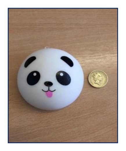
A sample 'squishy' and relative size to £1.00

These will cost either £1 or £2 (depending on the style) and profits will go to the Guide Dogs Charity. Please support this great charity.