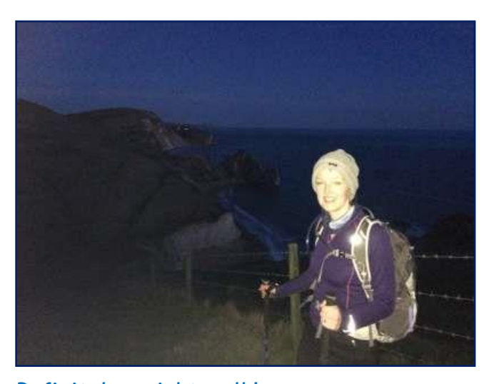
Definitely a night walk!