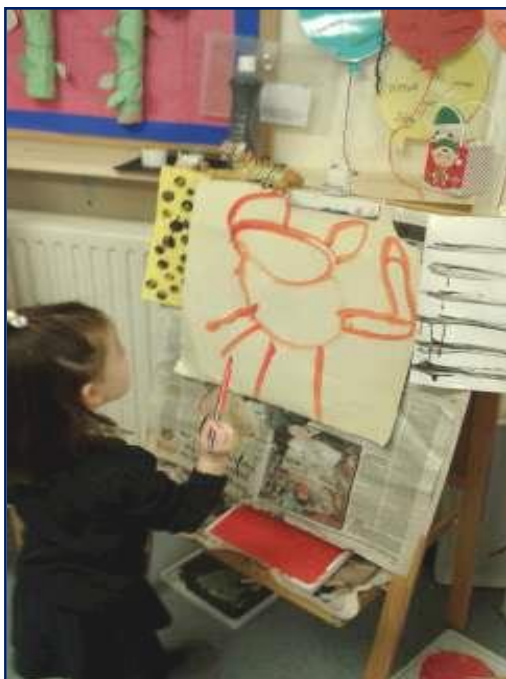
The beginning of a wonderful creation