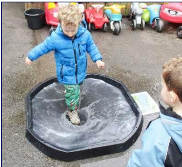
Fledglings went on a Bear hunt, splash, splosh, splash, splosh!