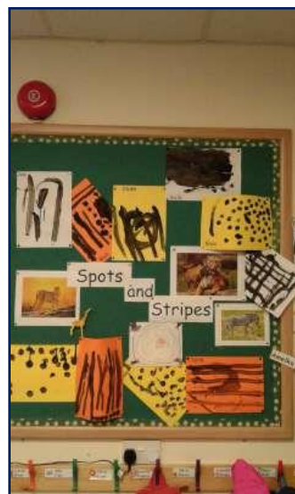
Spots and stripes everywhere