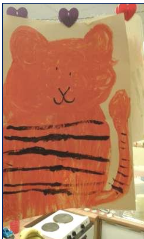
A finished tiger!

The children have been encouraged to paint a tiger and we have finished off with a tea party.