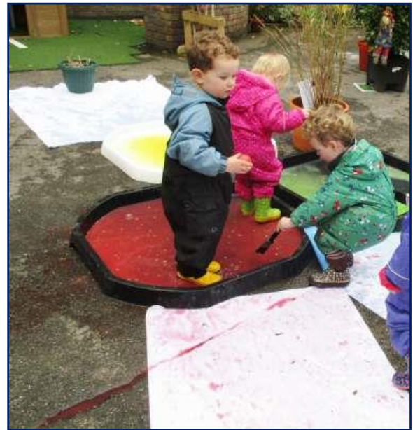
We experimented with colour, observing the marks our wellies made