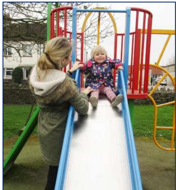
Ready Steady go! On a trip to the Steamroller park