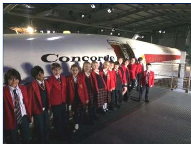
The Team on our Fleet Air Arm Museum Science trip

The children have been encouraged to paint a tiger and we have finished off with a tea party.