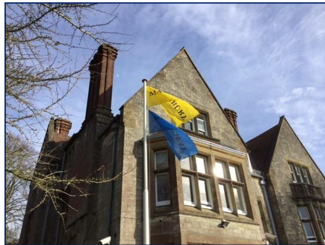
Flying the flags

It is unusual for two houses to share first place in the weekly house points total. We had to celebrate both Maumbury and Ridegway by flying both flags this morning. As the editor is a member of Maumbury house that one went up first!