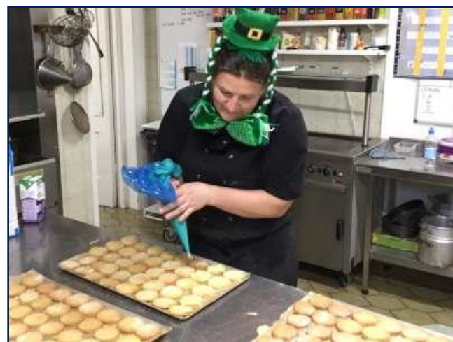
Irish style piping!