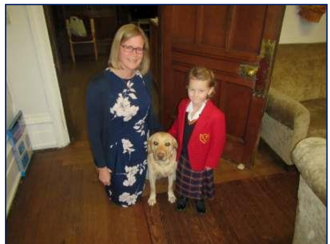
The Three M's